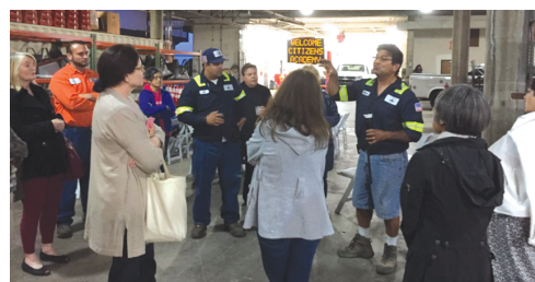
2nd Citizens Academy class learning about Public Works

Thanks to all our citizens who have participated!