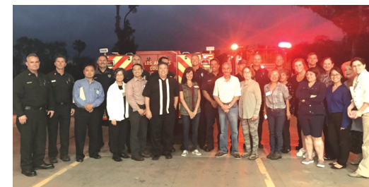
2nd Citizens Academy class learning about Fire & Paramedic Services