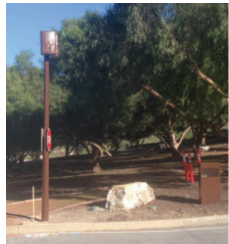
Mock-up at the intersection of Via Fernandez & Paseo La Cresta (approved)

Wireless carriers have authority under federal and state laws to install cell sites in the public rights-of-way and cities are provided with time frames by which they must approve or deny applications. The City has authority to affect reasonable controls on the "time, place, and manner" related to each installation in the right-of-way. "Time" refers to when the cell site is installed, such as the times during the day the installation may occur, or the days of the week that work can take place. "Place" refers to the specific location in the right-of-way in which the wireless carrier intends to locate its site. "Manner" refers to the aesthetics of the installation and to the means of construction. The City evaluates applications on a case-by-case basis.