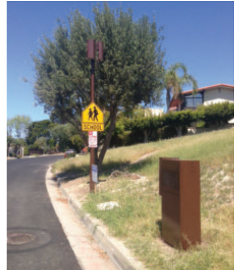
Mock-up across from 2325 Via Olivera

Yes. Prior to any City decision on a proposed new project, a mock-up and a notice board advising that the