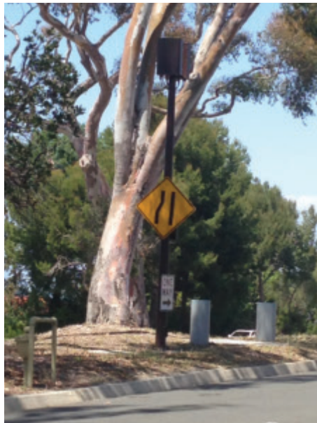
Mock-up at the intersection of Palos Verdes Drive West & Via Boronada (approved)

Palos Verdes Estates Municipal Code (PVEMC) Chapter 18.55 regulates Personal Wireless Service Facilities and Commercial Antennas. General design guidelines are provided regulating the location, design, and aesthetics of wireless facilities or commercial antennas.