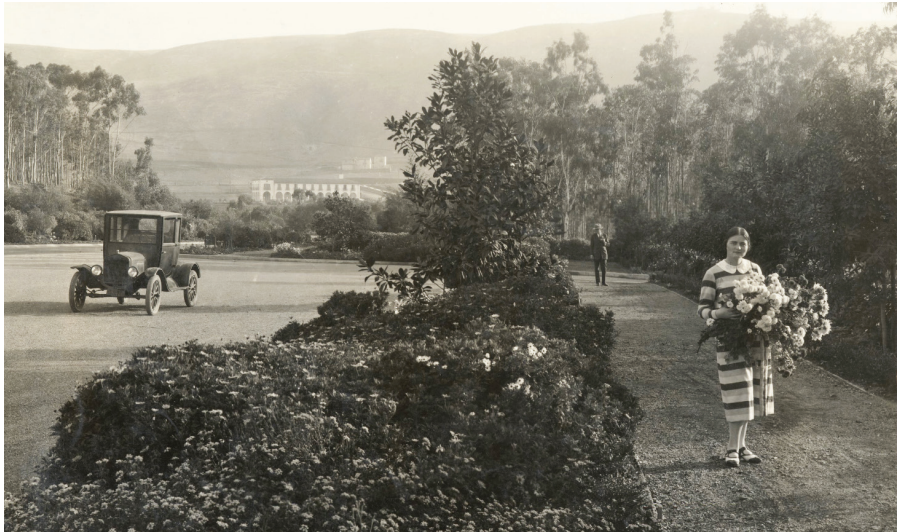
Walking path along Granvia La Costa (P.V.Dr.W.) with eucalyptus trees

Our trees are getting older and the drought is making an impact. Preservation and safety of our urban forest is a priority. In the early 1900's, a grove of Sugar Gum Eucalyptus was planted to frame the City entrance at Palos Verdes Drive West and usher in potential investors and new residents. In April 2015, due to health and safety concerns, 14 trees were removed and the remaining trees were trimmed. Six new Southern Magnolia tree were also planted to restore the original planting.