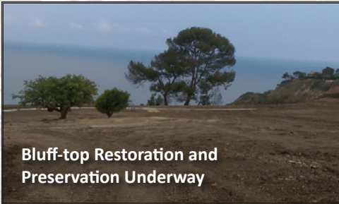
Bluff-top Restoration and Preservation Underway

Additionally, the City Council required that 70% of the the demolition debris be reused or recycled, keeping it out of the landfill. This means that the majority of wood, concrete and other building materials were recycled.