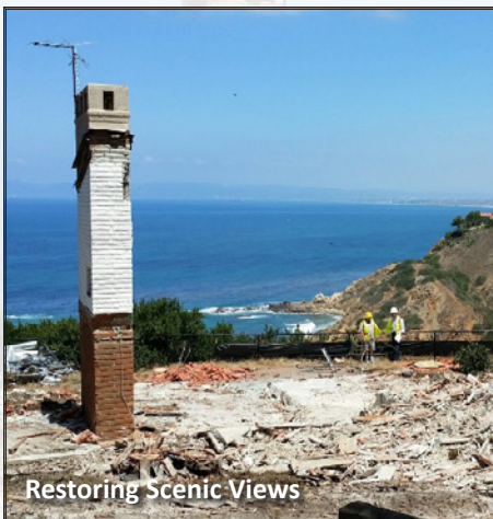
Restoring Scenic Views

Over the last several months in Palos Verdes Estates, bulldozers and earth moving equipment have been busy removing seven homes located above Bluff Cove along Palos Verdes Drive West. The City of Palos Verdes Estates acquired the homes as part of a settlement agreement arising out of earth movement and subsidence damage to the homes in that area in 1983. Showing signs of long-term damage and disrepair, the City Council decided in 2012 that the homes should be deconstructed and the properties become open space for the public. In late 2014, plans were approved to demolish the structures and in April 2015, the City initiated the project.