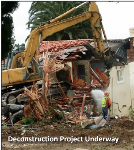
Deconstruction Project Underway