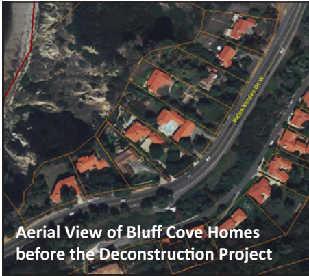
Aerial View of Bluff Cove Homes before the Deconstruction Project