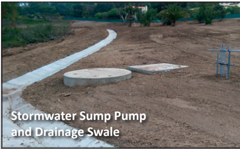
Stormwater Sump Pump and Drainage Swale