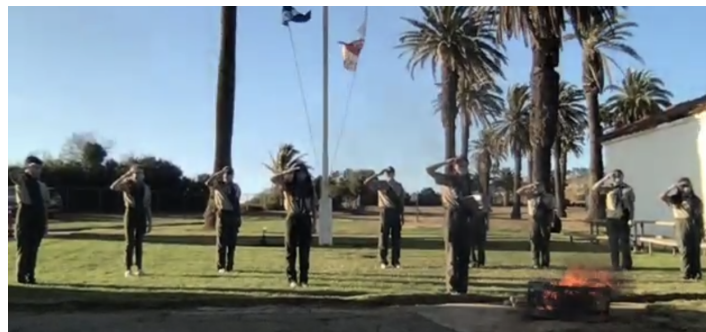
Above: Troop 258 Flag Retirement Ceremony - July 4, 2020